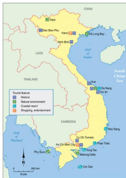
Figure 7.26 Vietnam's major tourist locations (VCE Geography units 1&2, Geography Teachers' Association of Victoria)